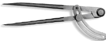
Compasso Bicos c/Arco