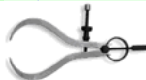
Compasso de voltas c/mola