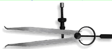
Compasso de Pernas c/Mola