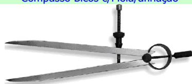
Compasso Bicos c/Mola/afinação