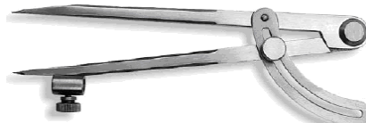
Compasso Bicos c/Anel p a lapis